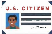
U.S. CITIZENSHIP CERTIFICATE WITH PHOTO