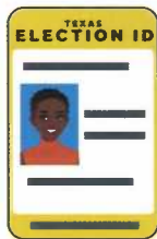
TEXAS ELECTION ID CARD*