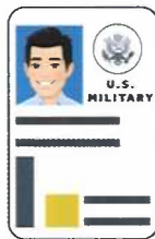
U.S. MILITARY ID CARD*