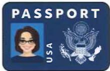
U.S. PASSPORT* (BOOK OR CARD)

BRING 1 OF THE 7 APPROVED FORMS OF PHOTO ID WITH YOU TO THE POLLS.