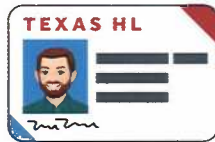
TEXAS HANDGUN LICENSE*