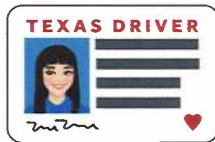
TEXAS DRIVER LICENSE*

WHAT IF I DO NOT POSSESS AND CANNOT REASONABLY OBTAIN ONE OF THESE PHOTO IDS?